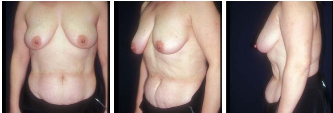
4 Years Postoperative